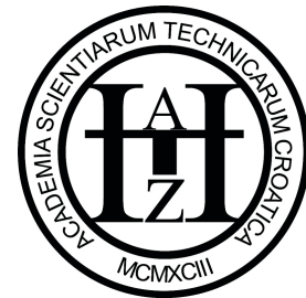
Croatian Academy of Engineering