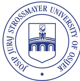
Josip Juraj Strossmayer University of Osijek