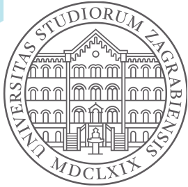
University of Zagreb